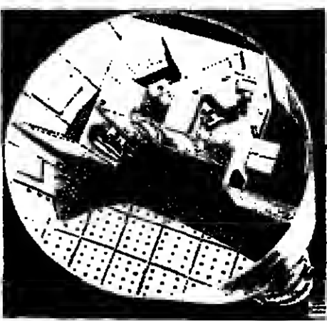
Raymond Loewy's conceptual design for the crew's quarters aboard Skylab is right out of a Jules Verne novel.

The press loved it, and Sotheby's publicity stunt came off brilliantly. The Times of London ran a long article on Loewy and the forthcoming sale.